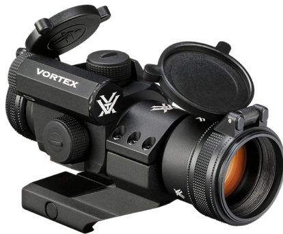
Cantilever Ring Option (Lower 1/3 Co-Witness Height)

The StrikeFire® II includes a cantilever mount. The cantilever ring mount puts the optic bore center 40 mm above the base, providing lower 1/3 co-witness with iron sights on flat top AR-15 rifles.